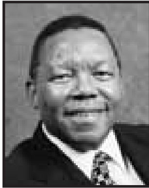
Dr Ben Ngubane Minister of the Department.