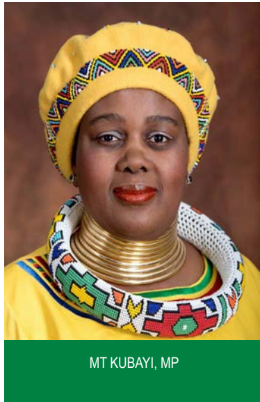
MT KUBAYI, MP

In the 2020-21 financial year we reported on numerous challenges that hampered the progress on the delivery of the sustainable human settlements. These challenges included availability of the well-located land for housing developments, scarce fiscal resources and the catastrophic effect of the Covid-19 pandemic. The Covid-19 pandemic, in particular, did not only have an impact on the construction side, but also rendered a number of our citizens jobless. This has had the resultant effect of adding to the demand for housing from individuals who were earning above the qualification criteria before the Covid-19 pandemic.