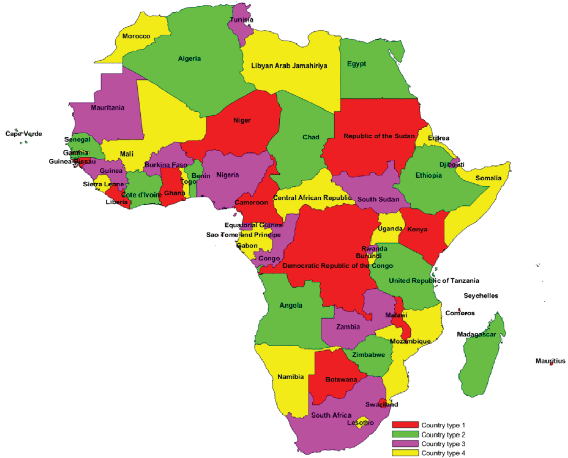
Figure 2: Country type map/PCI distribution map