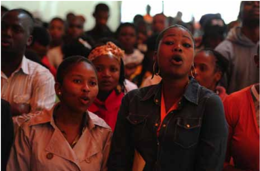
Youth attending the Youth Accord signing ceremony, Soweto April 2013