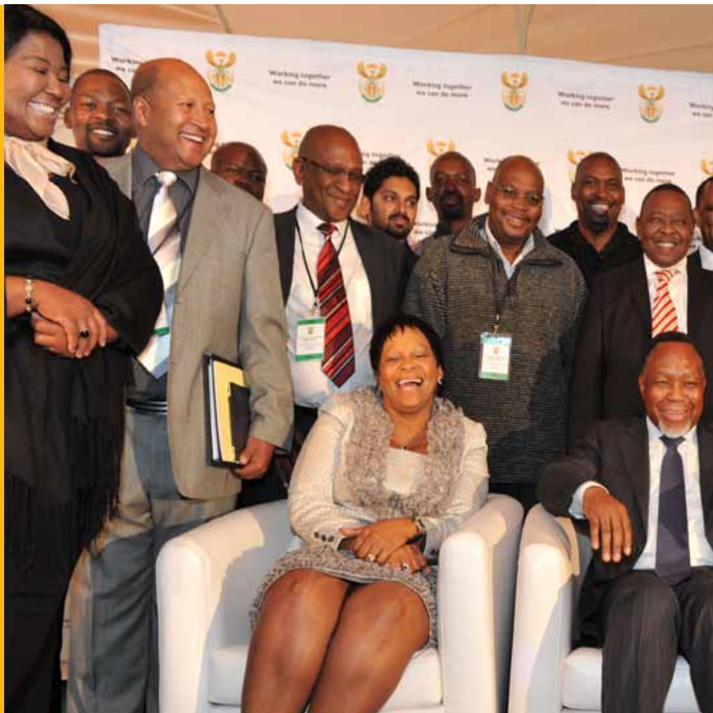
Signatories at the signing ceremony, Soweto, April 2013