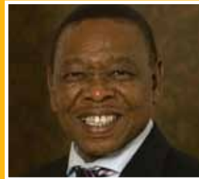
Minister Blade Nzimande Minister of Higher Education and Training

We accept the responsibility of leading and providing the best possible environment for youth skills acquisition, education and training as part of developing our country. This Youth Employment Accord emphasises the fact that together, we can create more employment and turn every workplace into a training space. The timing of the Youth Employment Accord is perfect.