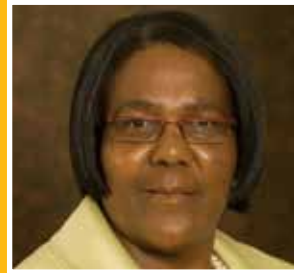
Minister Dipuo Peters Minister of Energy

We pledge our support to the Youth Employment Accord, a key milestone in addressing the unemployment of young people. The green economy (manufacturing and energy) presents enormous potential for our youth to participate. As the country's Energy Plan is rolled out, we will need more engineers, operators and artisans and we will work with young people to make use of opportunities availed to them.