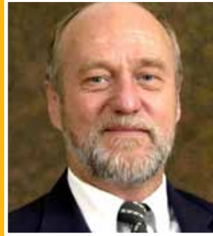
Minister Derek Hanekom Minister of Science and Technology

Young people hold the future of this country in their hands. It is a future in which science and technology will play a massive role in combating disease, slowing the pace of climate change, moving towards a lower carbon economy, and creating a better life for the citizens of the world.