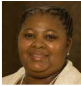
Minister Ben Martins Minister of Transport

The signing of the Youth Employment Accord presents opportunities for meaningful experience of the work environment for our youth. They will gain life-long skills and the discipline necessary to make it in life. We are committed to double our efforts to grant opportunities to the youth and teach them responsibility to help them succeed in life